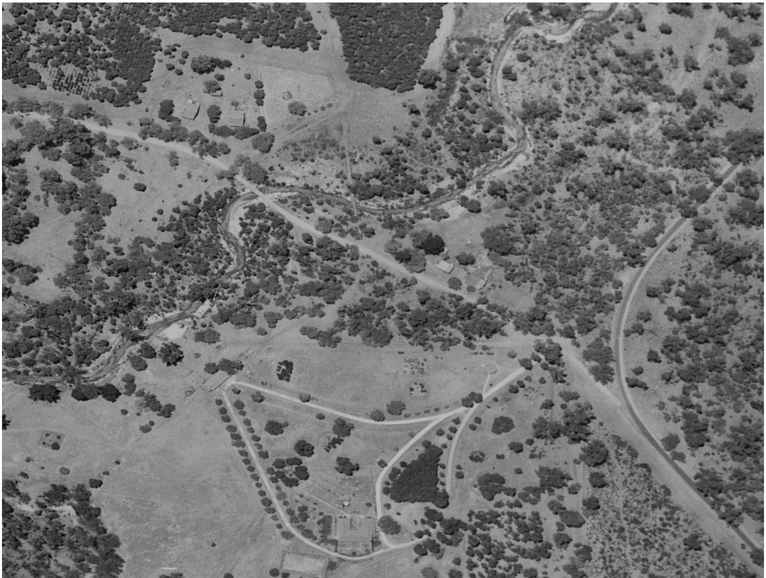
Aerial photograph of the Ludlow Settlement MAP1496_frame7125 (11 November 1941)